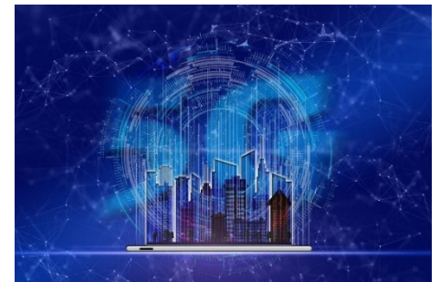
Figure 2: We explore Time-Sensitive Networking in 5G contexts... paving the way towards a reliable 6G?

https://www.iotworldtoday.com/connectivity/the-next-chapter-in-the-world-of-iot-addressing-the-new-wave-of-the-iot-with-edge-ai